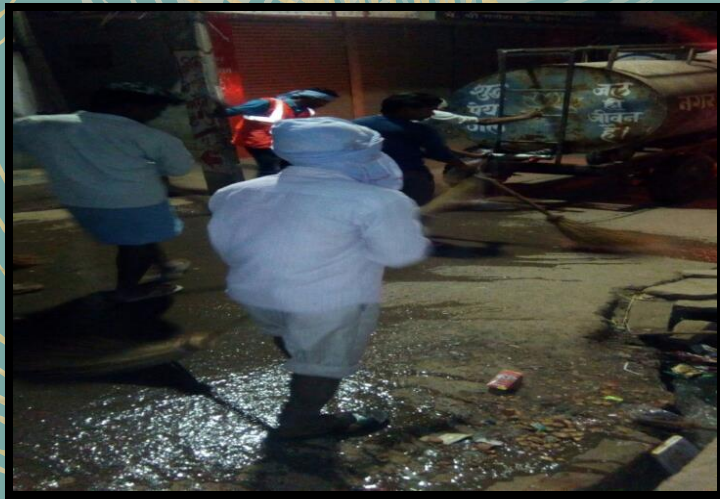
Drain cleaning on daily basis