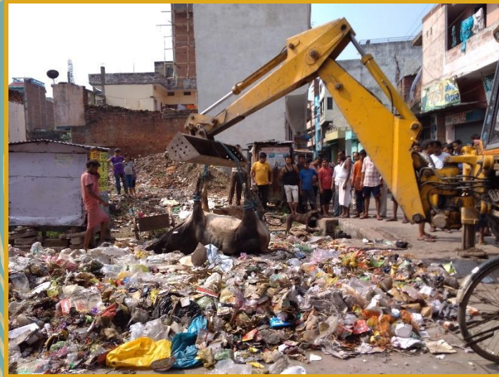
Removing dead Body from Waste Dumping point