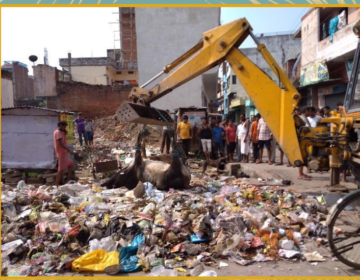
Removing dead Body from Waste Dumping point