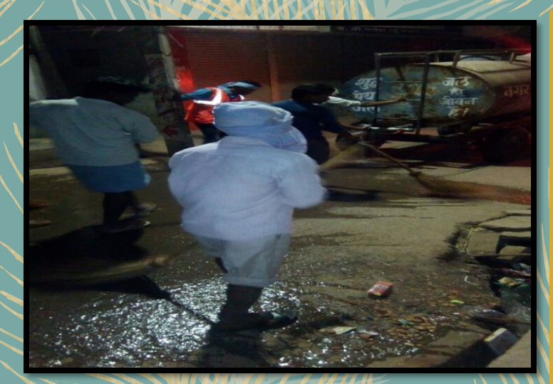
Drain cleaning on daily basis