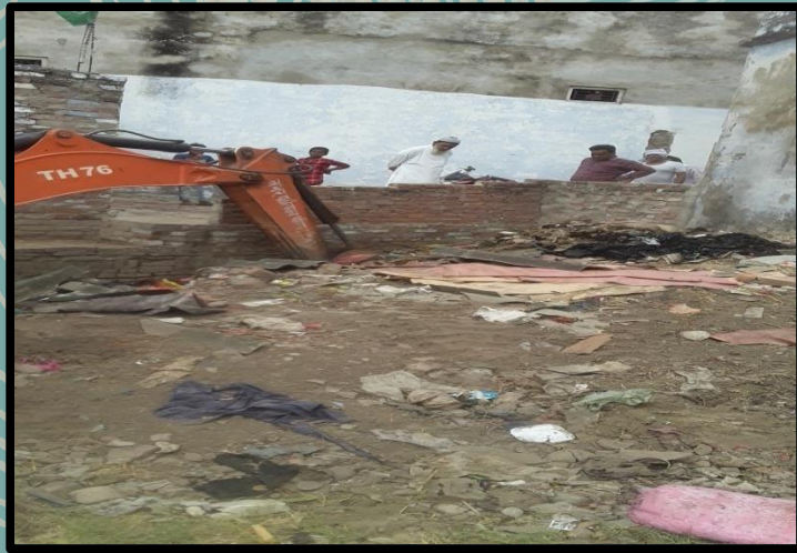
Drain cleaning on daily basis