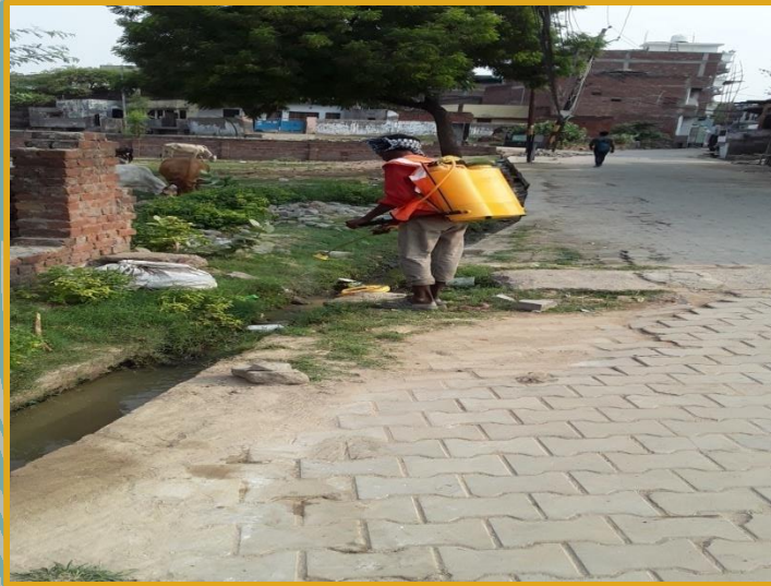
Removing Mosquitoes from sewerage naliya by sprinkling of chemicals