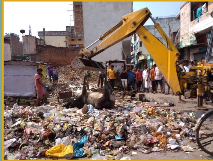
Removing dead Body from Waste Dumping point