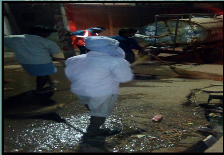
Drain cleaning on daily basis